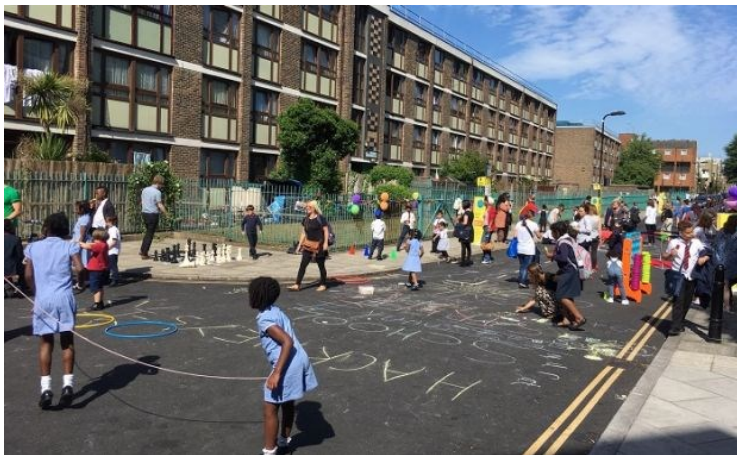
The School Streets programme had parents, kids and teachers all spontaneously playing and talking together.