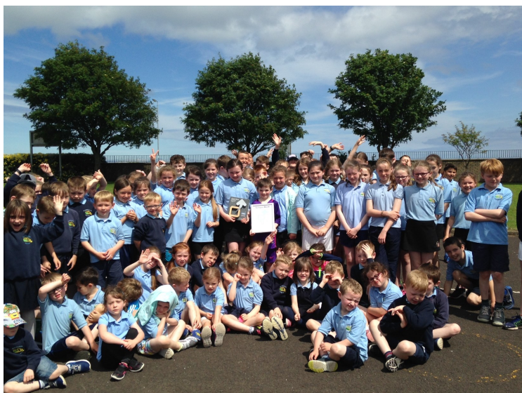
Pupils from St Patrick's PS, Glenariff with their new Sustrans School Mark Silver award.