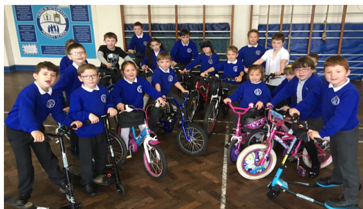
Dr Bike visited Crumlin IPS to tighten brakes, pump tyres and oil chains as part of a bike safety day to help the pupils keep safe on their active journeys.