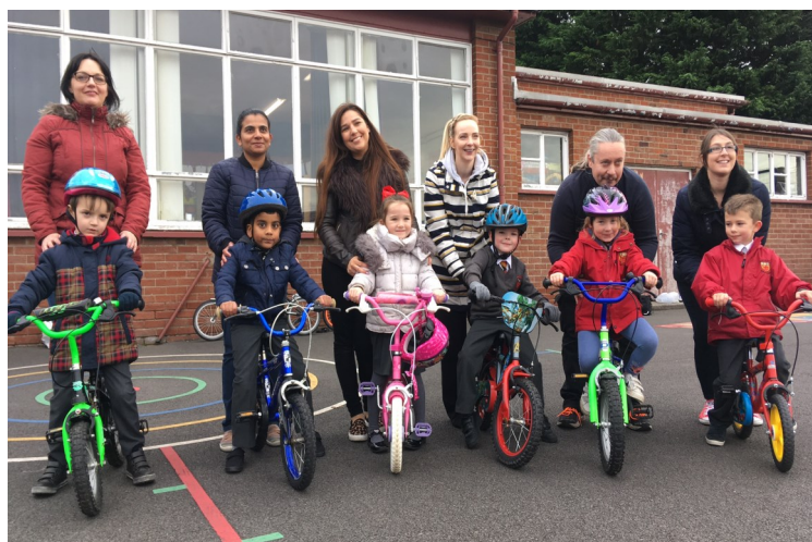
Pupils and parents from Antrim PS ditching the stabilisers.