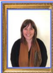
Deputy Designated Teacher for Child Protection