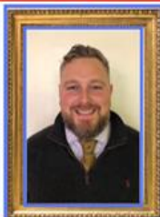
Deputy Designated Teacher for Child Protection