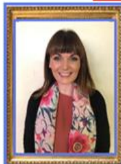
Designated Teacher for Child Protection