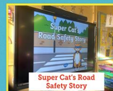
Super Cat's Road Safety Story