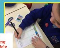
Year 2 sequencing how to safely cross the road.