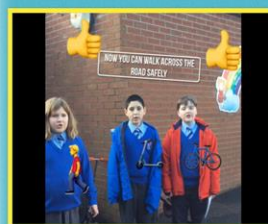
Year 6 pupils used ICT to create Road Safety videos